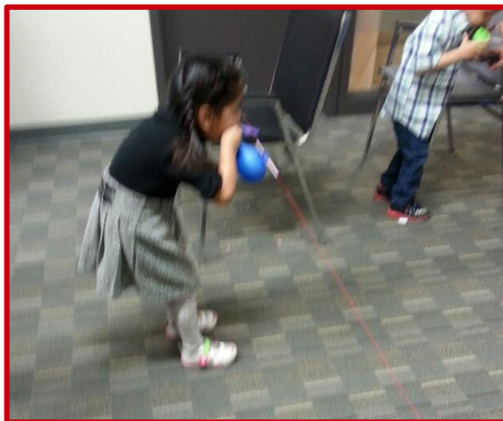
Children had fun making their rockets fly?