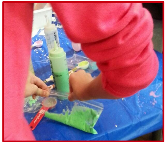
Mix glue, Borax and water . . . Squish, Squish, Squish - Gak!