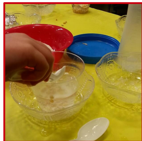
Water, baking soda, and vinegar, mix together add a few popcorn kernels and see the popcorn dance before your eyes!