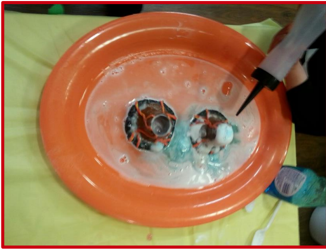
Children made their own volcano.